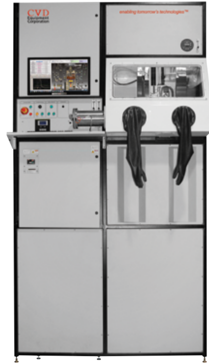
Vertical Dipping LPE System (Requires a platform)