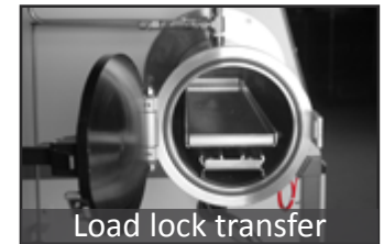
Load lock transfer